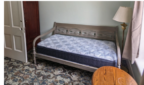
A new bedroom in Teller House!