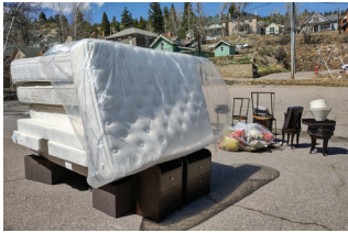
Well needed new mattresses!