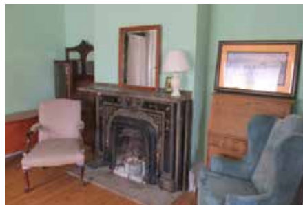
D'Albe House, one among the many historic properties in Central City Festival staff and artists will call home this upcoming 2024 Opera Festival season.