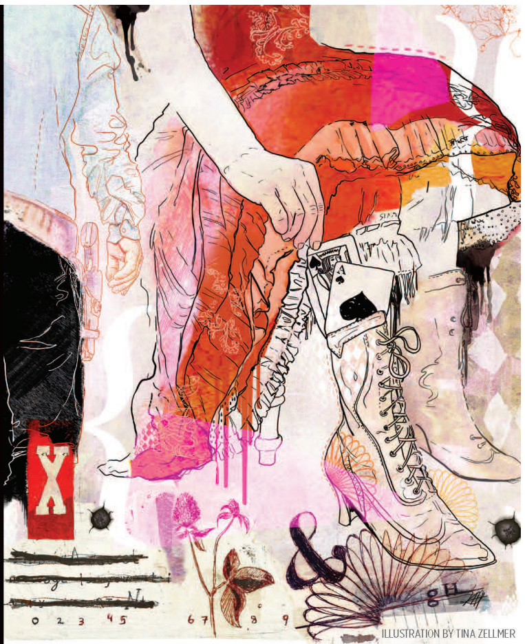
ILLUSTRATION BY TINA ZELLMER